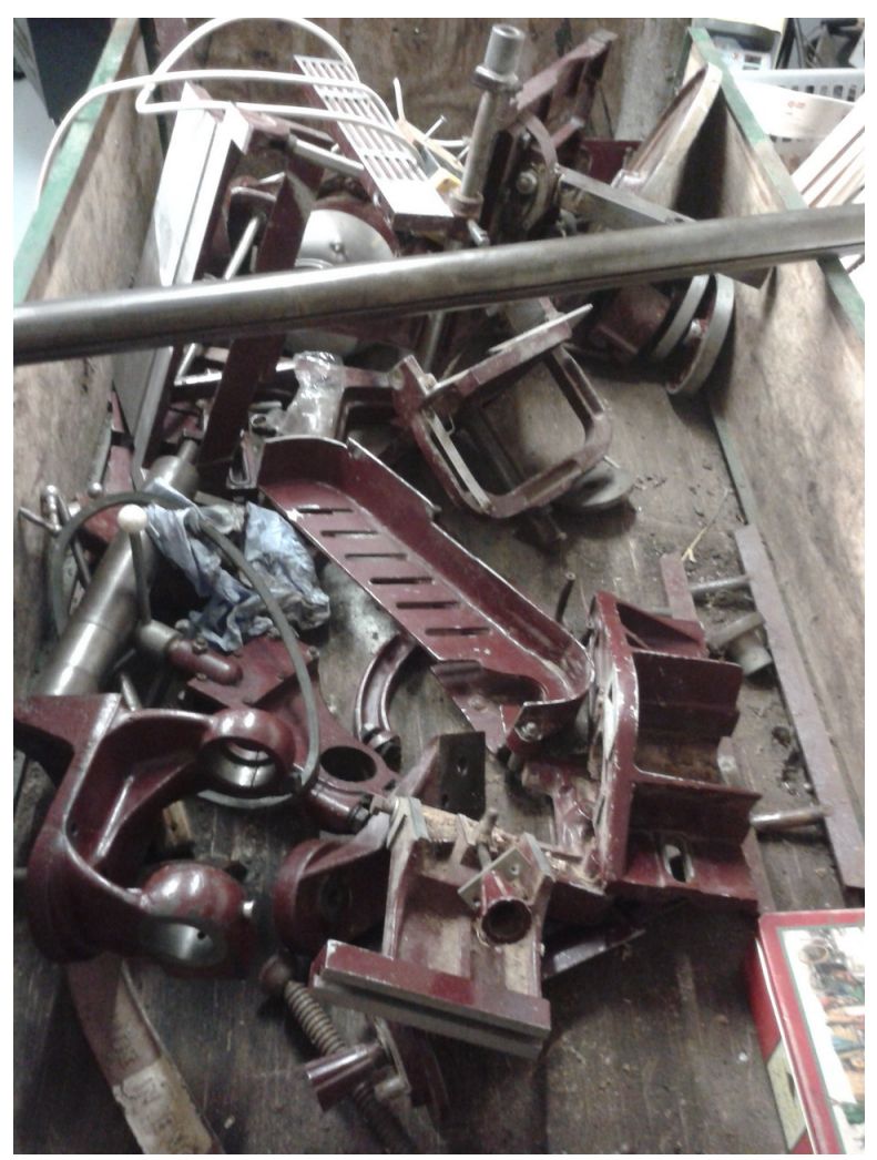
Plate 1 - a Jumble of bits.

It had loads of attachments, some of which I could identify (planer / thicknesser, saw, combi table, motor with speed reduction gearbox etc) and some others that I couldn't as they were quite a jumble (see Plate 1 ).