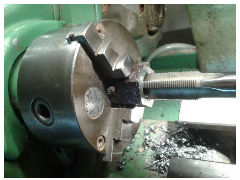
Plate 3 - Tapping the nut