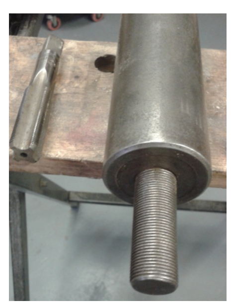
Plate 2 - Mounting bar showing the threaded stud for attaching the Planer

I hit a problem, which held up the whole shooting match, in that I was missing the circular threaded collar that fastens the planer onto the Mounting Bar. I did try D. Pyatt but unfortunately he didn't have one.