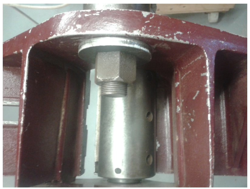
Plate 5 - Completed mounting nut and 5.7mm thick washer

If you find you need any further info you can contact me at <a href="mail@butnben.net">mail@butnben.net</a> or via Pete at the Boleyn Workshop.