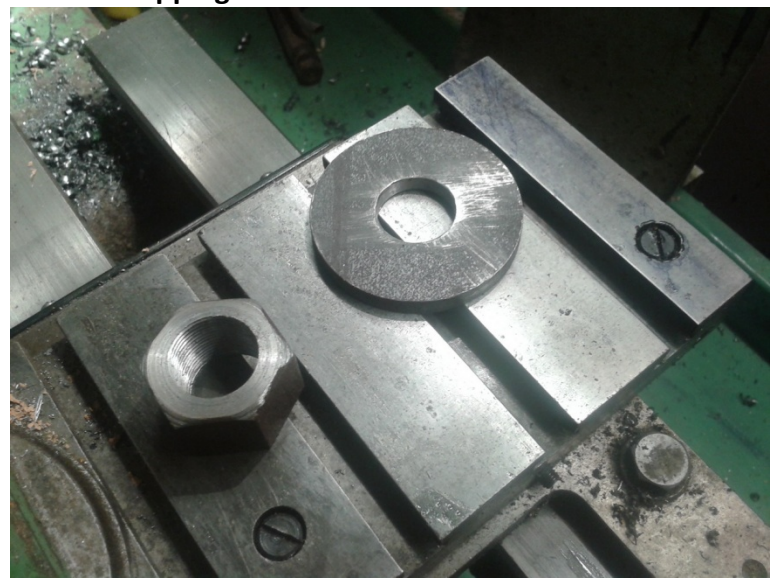
Plate 4 - Completed mounting nut and 5.7mm thick washer

Something which really frustrated me was that I could not find anywhere a photo or diagram showing exactly how the planer is attached to the mounting bar. I must have trawled through hundreds of photos to no avail. So, I have included a photo here ( Plate 5 ) taken from underneath which shows exactly how the planer is mounted which I hope others may find useful.